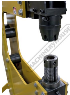
Quick Release Tooling Change