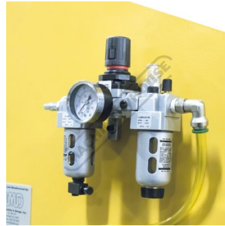
Air Filter Regulator & Lubrication System