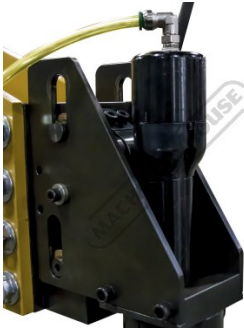
Pneumatic Hammer Unit