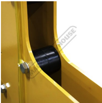
Heavy Steel Plate Frame