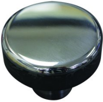
B8972 Doming Bottom Die