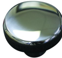
B8973 Stretch Flat Bottom Die