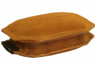
S214 Rectangle Leather Bag - Steel Shot Filled