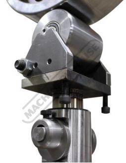
Quick Release Lower Anvil Support