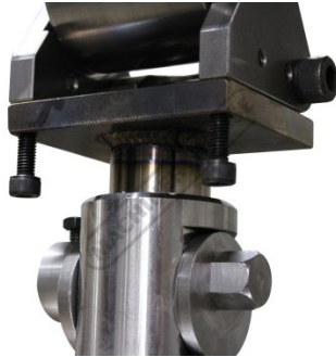
Bottom Anvil Tilt Adjustment