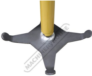
Tension Adjustment Wheel