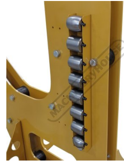
Includes 8 Anvil Sets