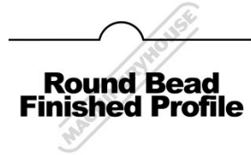
Round Bead Finished Profile