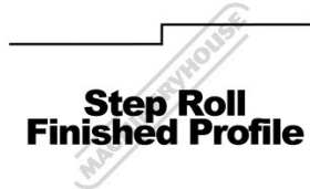
Step Roll Finished Profile