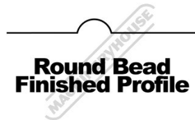
Round Bead Finished Profile