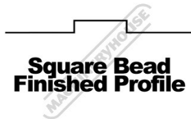
Square Bead Finished Profile