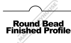
Round Bead Finished Profile