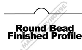
Round Bead Finished Profile