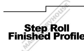
Step Roll Finished Profile