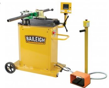
B8085 Motorised Pipe & Tube Rotary Draw Bender