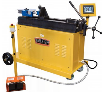
B8095 Motorised Pipe & Tube Rotary Draw Bender