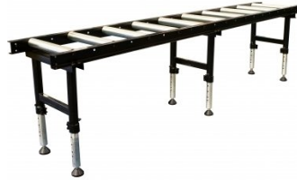
L830 Roller Conveyor with Adjustable Stands - Heavy Duty