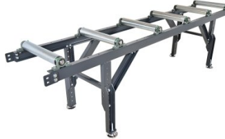
L835 Roller Conveyor with Adjustable Stands - Extra Heavy Duty