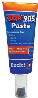
S075 Cutting Tool Lubricant Paste - 200g