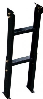
L814 Roller Conveyor Stand