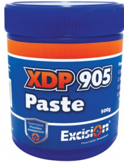
S074 Cutting Tool Lubricant Paste - 500g