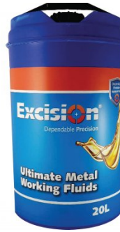
S091 Soluble Metal Cutting Fluid - 20 Litre