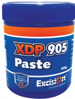
S074 Cutting Tool Lubricant Paste - 500g