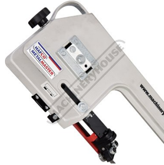
Blade Tension Handle