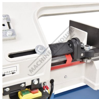
Left Adjustable Blade Guide