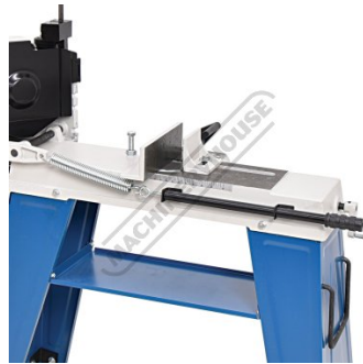
Adjustable Spring Tension to Regulate Cutting Feed Rate