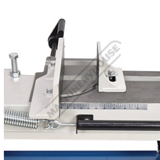
Vice at 90 Degrees