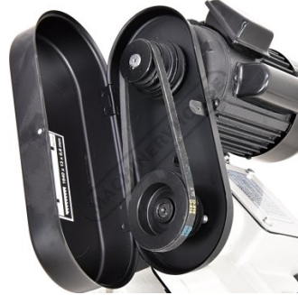
3 Speed Pulley Drive System