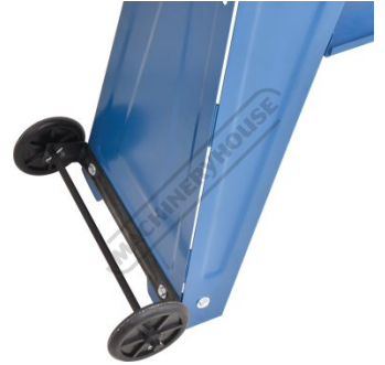
Portable for Site Work