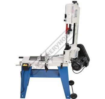
Front View 3