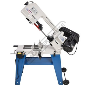
Front View 2