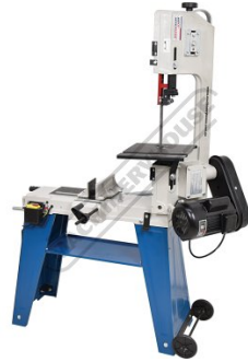
Head Fully Up with Vertical Table