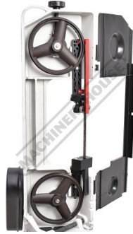
Blade Guard Open