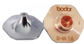
AL3054 1.6 Nozzle Single Layer