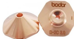
AL3014 3.0 Nozzle Single Layer