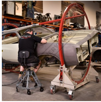
Perfect For Resto Jobs