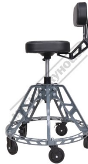
Maximum 760mm Height