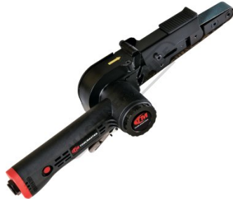
20 x 520mm belt size