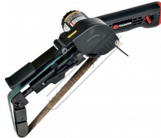
Swivel Belt Arm