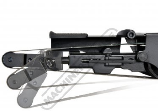
Bendable arm to 55 degrees