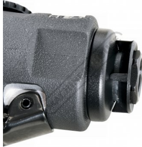
Rear Exhaust With Built In Silencer