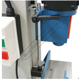
Adjustable Depth Stop