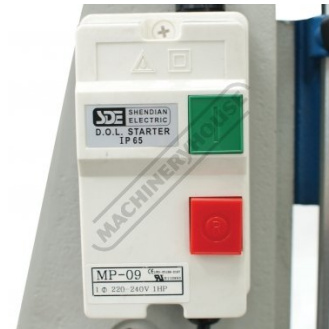
Magnetic Safety Switch