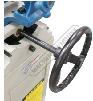
Cross Slide and Table Travel Handwheel