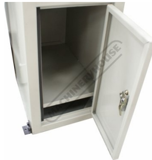
Large Storage Cabinet