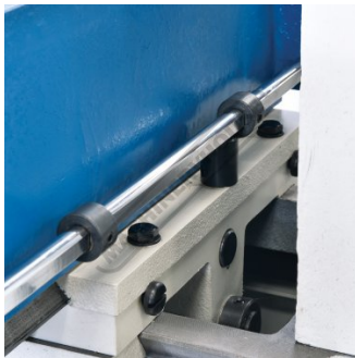
Adjustable Table Stops