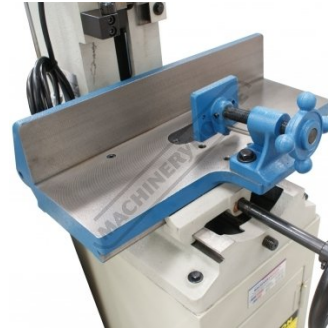
3 Position Heavy Duty Vice