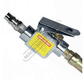
Pneumatic Valve Control