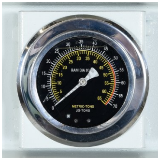
Metric / Imperial Pressure Gauge