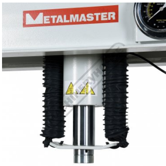
Ram With Safety Covers for Springs