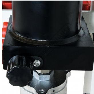
CNC Welded Hydraulics