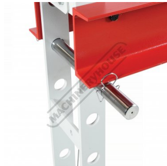
Table Pins With Safety Clips