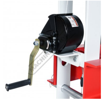
Table Winch Height Adjustment