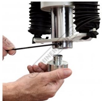
Includes Removable Ram Top Cap