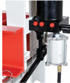
High Quality Hydraulic Pneumatic System