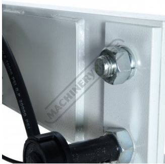
CNC Machine Welded Frame