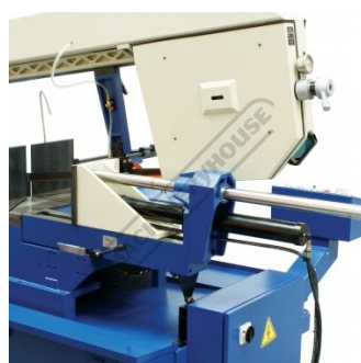
Vice Rear View