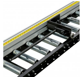
L800 Length Stop To Suit Roller Conveyor