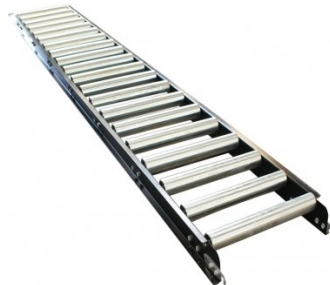
L818 Roller Conveyor