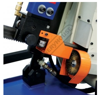
Blade Guides and Blade Cleaning Brush