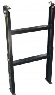
L820 Roller Conveyor Stand