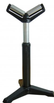
W3436 Roller Stand - V-Type