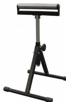
W343A Roller Stand