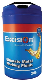
S091 Soluble Metal Cutting Fluid - 20 Litre