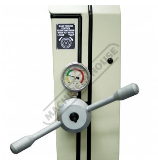
Blade Tension Dial with Gauge