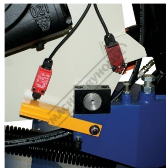
Micro Switches Control on Head