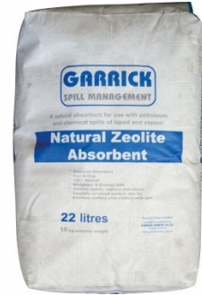
O000A Natural Zeolite Absorbent