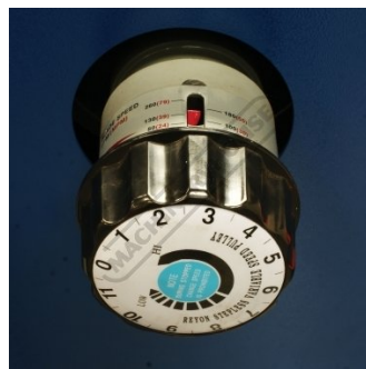
Variable Blade Speed