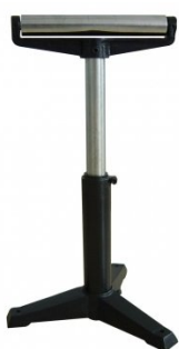
W3434 Roller Stand