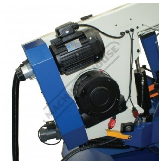
Gearbox and Motor