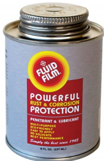
O043 Rust & Corrosion Preventive - Penetrant & Lubrication