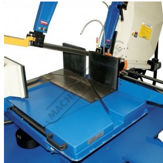
Vice Dual Mitre