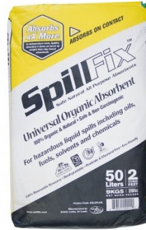
O000 SpillFix Universal Organic Absorbent