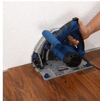
Ideal for edging up to 15.5mm from the wall