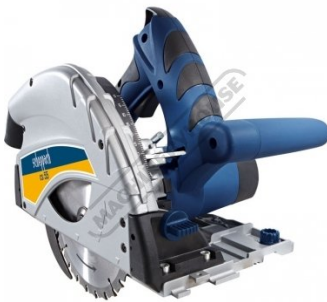
W875 Circular Plunge & Mitre Cut Saw