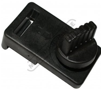
W878 Anti-Fall Over Saw Clamp