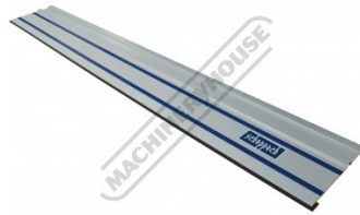
W876 Aluminium Guide Rail