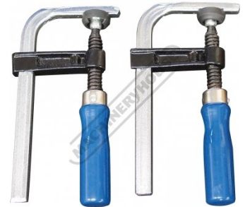
W8775 Heavy Duty Clamp Set