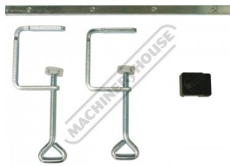
W877 Guide Joiner, Clamps & Stop Accessory Kit