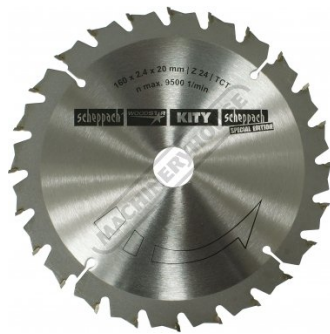
W879 Saw Blade - 160mm x 24T