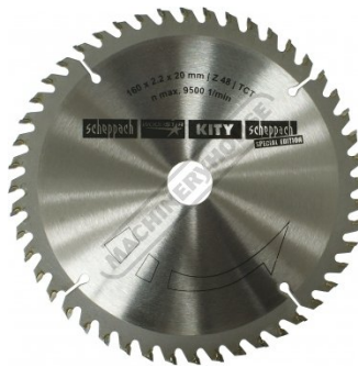
W880 Saw Blade - 160mm x 48T