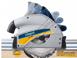
55mm maximum stepless cutting depth