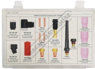
Inside Lid Diagram