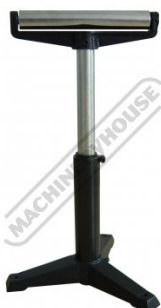
W3434 Roller Stand