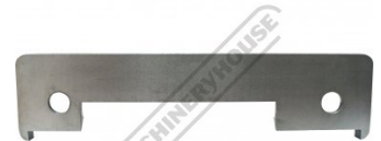
KA0999 DADO BLADE INSERT