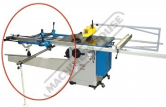
W458 Sliding Table