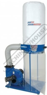
W394 Dust Collector