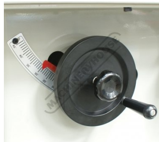
Blade Height Adjustment Handle & Angle Scale