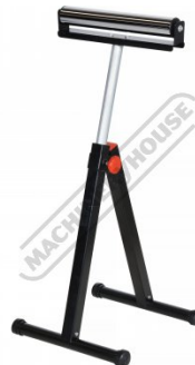
W343 Roller Stand