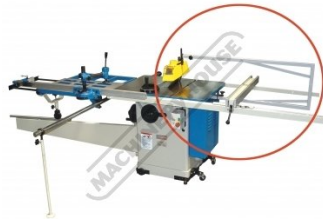
W459 Saw Guard Hood