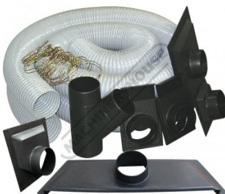
W344 Timber Dust Accessory Kit