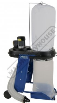
W886 Dust Collector