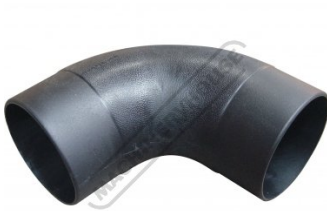
W336 Dust Hose Elbow