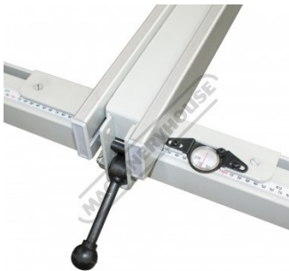
Single Lock Lever on Rip Fence with Magnified Scale