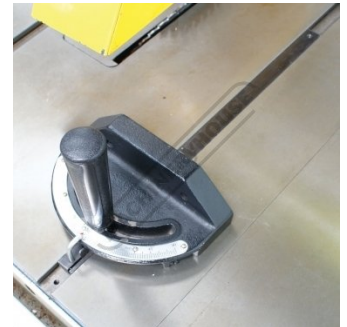
Heavy Duty Mitre Guide 60 degrees