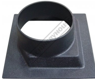
W339 Dust Hose Floor Sweeper Attachment