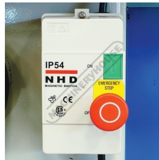
Magnetic Safety Switch