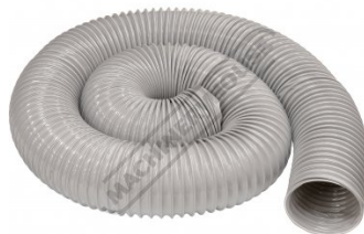
W398 Dust Hose - Timber Only