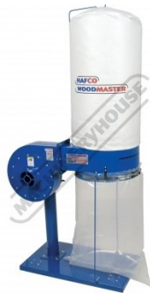
W332 Dust Collector