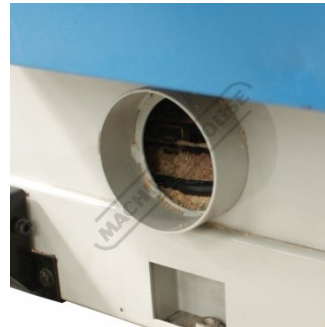
100mm Dust Chute