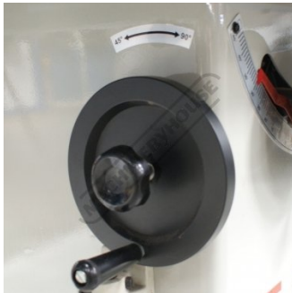
Tilt Arbor to 45 degrees