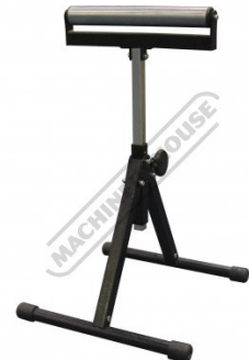
W343A Roller Stand