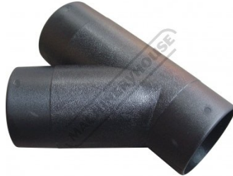
W337 Dust Hose Y Adaptor