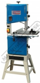
W952 Wood Band Saw