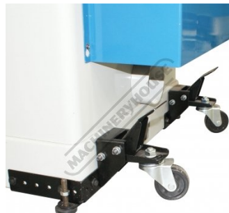
Swivel Wheels on Mobile Base with Leveling Screws