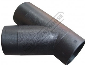
W337 Dust Hose Y Adaptor