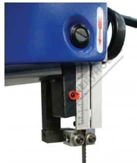
Ball Bearing Blade Guides