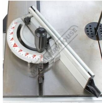
Mitre Guide 0 45 Degrees