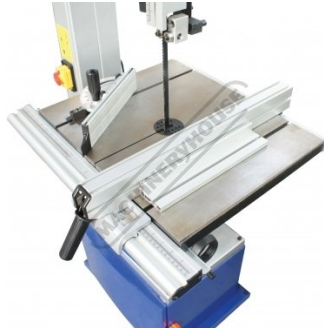
Sliding Rip Fence