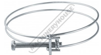
W340 Dust Hose Clamp