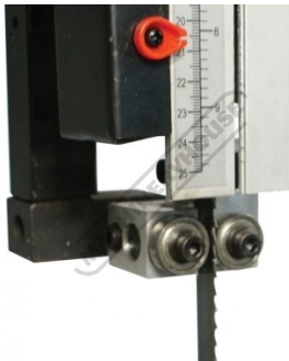
Ball Bearing Blade Guides