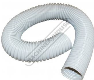
W398 Dust Hose - Timber Only