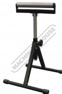
W343A Roller Stand