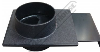
W335 Dust Hose Shut Off Valve