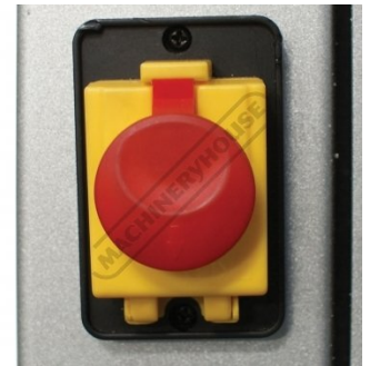
Magnetic Safety Switch