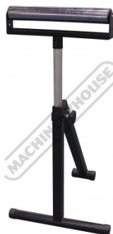
W343 Roller Stand