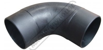
W336 Dust Hose Elbow