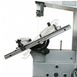
Cast Iron Table Tilts to 45 degrees