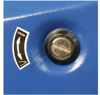
Safety Locks on Doors