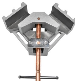
V100 90 degree Angle Vice Clamp