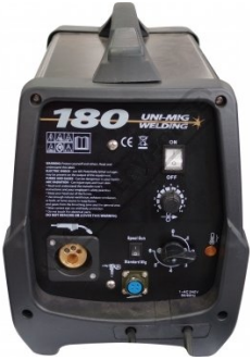
1 Front View