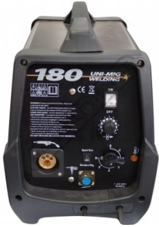
1 Front View