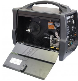
3 Lid Open