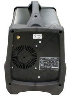
4 Rear View