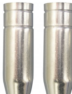
W535 2 x Conical Nozzles