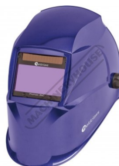
W002 Auto Darken Welding Helmet - 9~13 Shade