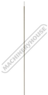
W590 Tig Tungsten Electrode - Zirconiated White