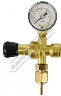
O0171 Argon Gas Regulator