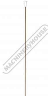
W596 Tig Tungsten Electrode - Zirconiated White