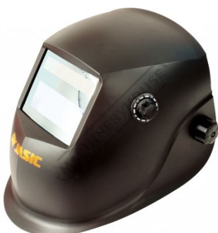
W1555 Auto Darken Welding Helmet - 9~13 Shade