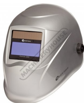
W001 Auto Darken Welding Helmet - 9~13 Shade