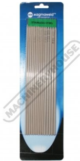
W212 Welding Electrodes - Stainless Steel