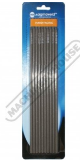
W213 Welding Electrodes - Hard Facing