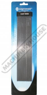
W214 Welding Electrodes - Cast Iron