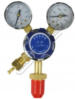
W160A Argon Gas Regulator-Twin Gauge