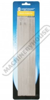
W211 Welding Electrodes - Multi-Purpose