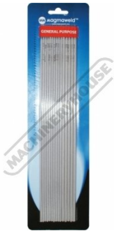
W210 Welding Electrodes - General Purpose