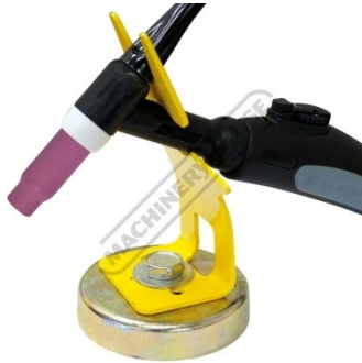
W241 Welder Trolley - Suits MIGS & TIGS