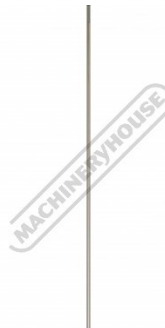
W597 Tig Tungsten Electrode - Ceriated Grey