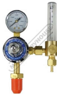
W161 Argon Gas Regulator-Bobbin Flowmeter