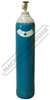
O3065 Gas Refillable Cylinder