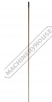
W598 Tig Tungsten Electrode - Ceriated Grey