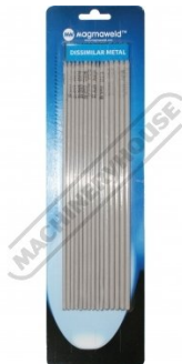
W215 Welding Electrodes - Dissimilar Metal