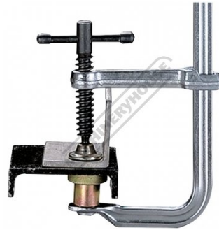
Clamping With Step Over