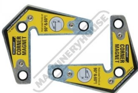
W1010 Corner Magnets - (2-Pack)