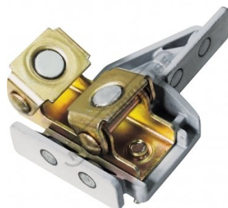
W1023 MagTab AL Magnet