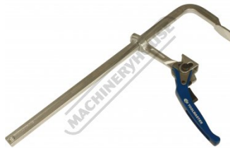
C0015 Ratchet F Clamp