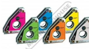
W1008 Mini Magnet Squares - (6-Pack)