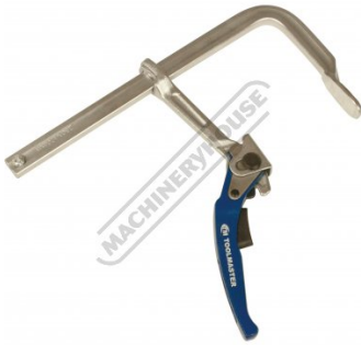
C0012 Ratchet F Clamp