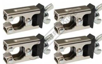
W112 Micro Welding Steel Clamp Set