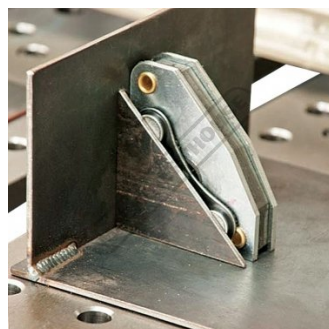
W1011 XYZ Magnet Squares - Multi-Angle - (2-Pack)