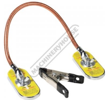
W1005 Snake Magnet & Spring Clamp