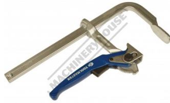
C0013 Ratchet F Clamp