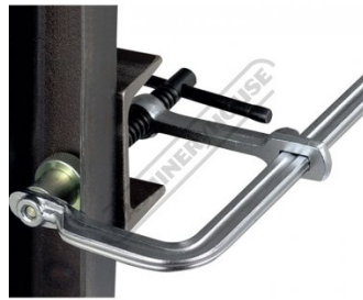
With Extender Block Jaw