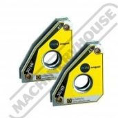
W1009 Mini Magnet Squares - (2-Pack)