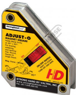
W1006 Adjust-O Magnet Square - Heavy Duty