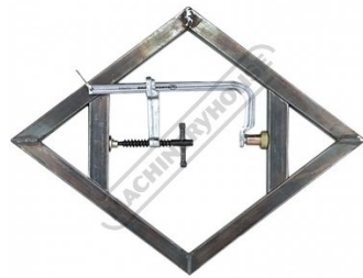
Shown As Spreader