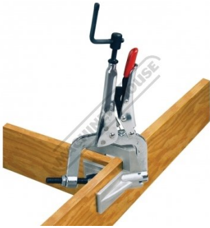
W1013 Corner Clamping Plier