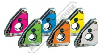
W1008 Mini Magnet Squares - (6-Pack)