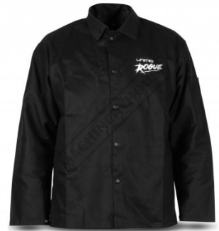
W1003 ROGUE™ PROBAN® Welding Jacket