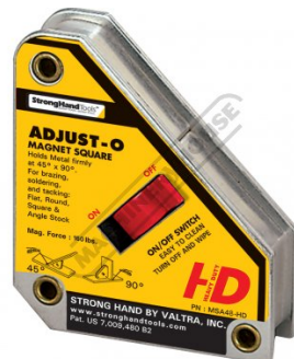
W1006 Adjust-O Magnet Square - Heavy Duty