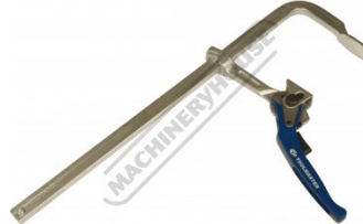
C0015 Ratchet F Clamp