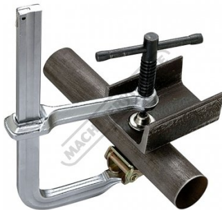
Clamping Steel Pipe