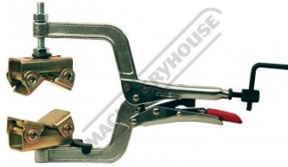
W1014 Pipe Plier - Large