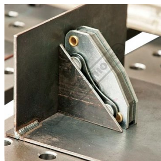
W1011 XYZ Magnet Squares - Multi-Angle - (2-Pack)