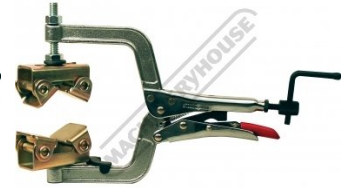
W1015 Pipe Plier