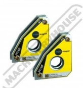
W1009 Mini Magnet Squares - (2-Pack)