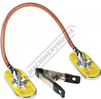
W1005 Snake Magnet & Spring Clamp