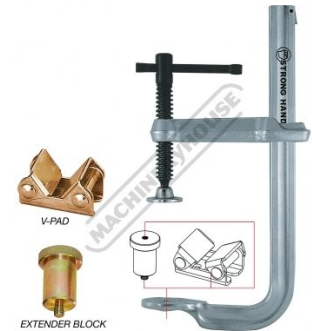
W1026 4 In One Utility Clamping System