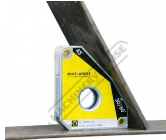
Shown In Use 30 Degree