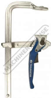
C0013 Ratchet F Clamp