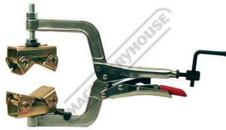
W1014 Pipe Plier - Large