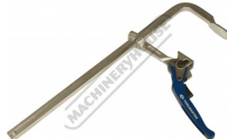
C0015 Ratchet F Clamp