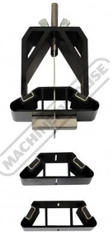
W114 3 Angles Welding Aluminium Clamp Set