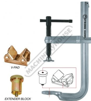
W1025 4 In One Utility Clamping System