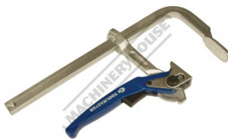
C0013 Ratchet F Clamp