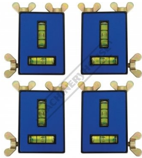
W115 Precision Welding Aluminium Clamp Set