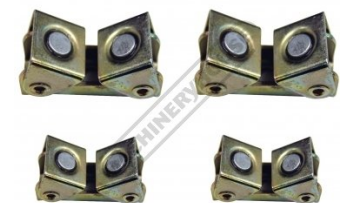
W1021 Magnetic V-Pad Kit - (4 Pack)