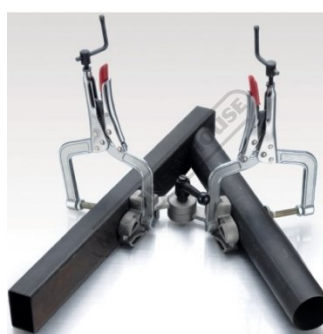
W1012 Adjustable Corner Clamping Plier Set