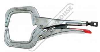
W1016 Locking C-Clamp - Round Tip