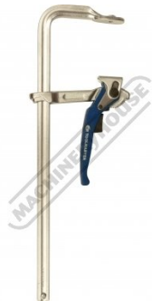
C0015 Ratchet F Clamp