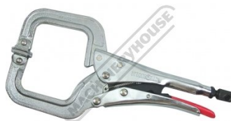
W1018 Locking C-Clamp - Swivel Tip