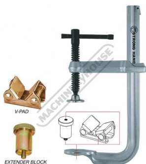
W1027 4 In One Utility Clamping System