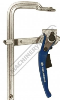
C0010 Ratchet F Clamp