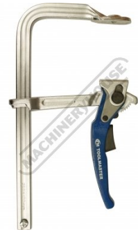
C0012 Ratchet F Clamp