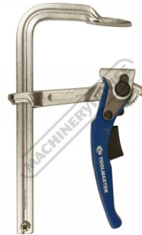
C0010 Ratchet F Clamp