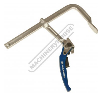
C0012 Ratchet F Clamp