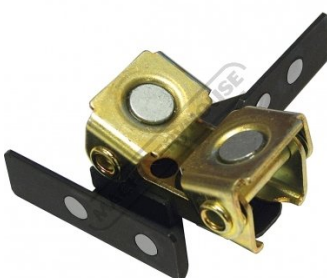
W1022 MagTab Magnet