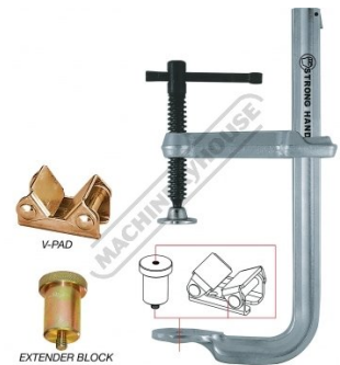
W1026 4 In One Utility Clamping System