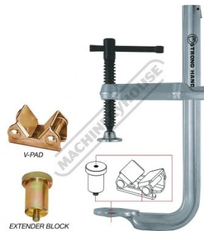
W1025 4 In One Utility Clamping System