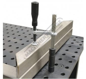
Shown Screwed into Optional Threaded Riser and Adaptor