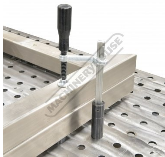
Shown Screwed into Optional Threaded Riser