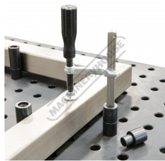
Shown Screwed into Optional Adaptor View2