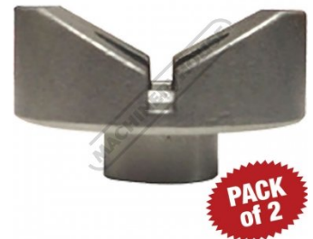
W08016 BuildPro Aluminium V-Block