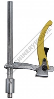
W07910 BuildPro Inserta Clamp