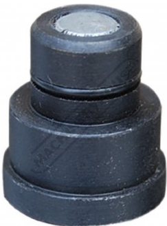
W08020 BuildPro Magnetic Plug / Rest Button