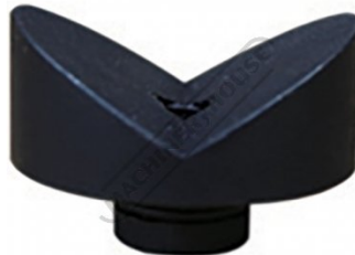
W08014 BuildPro V-Block