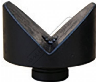
W08010 BuildPro V-Block