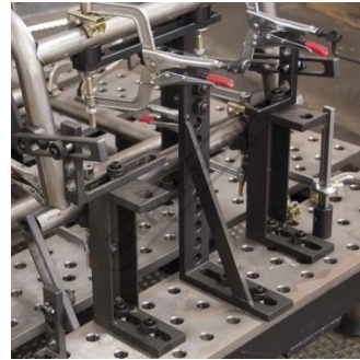
The Inside Channel and the Holes and Slots Provide Unlimited Versatility in Clamping Locating and Positioning