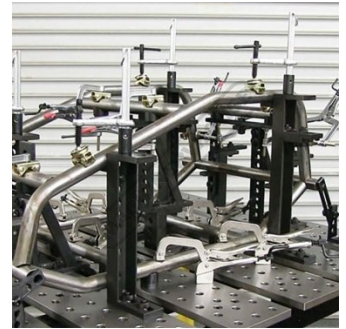
Economy Stops are Used as the Framework in this Fixture with Varying Heights Angles and Stock Shapes