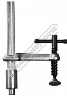
W07908 BuildPro Inserta Clamp - T-Handle