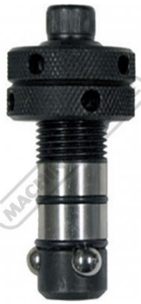
W08048 BuildPro Ball Lock Bolt