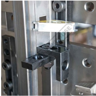
Use the Should Screws to hold BuildPro Clamps and fixturing components in a precise location