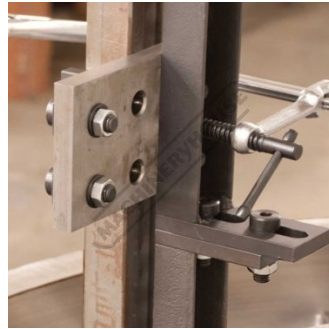
Use the Should Screws to hold BuildPro Clamps and fixturing components in a precise location