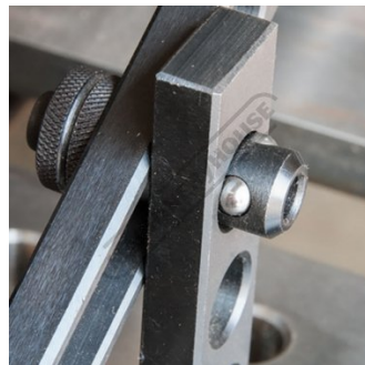
When engaged tightened three steel locking balls move outward to lock underneath the table