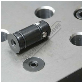
Ball Lock Bolts are an essential component in modular fixturing