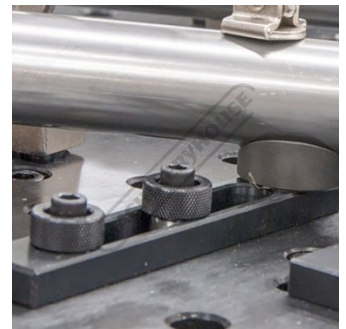
Efficient way of fastening fixture elements