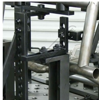
Use Ball Lock Bolts to fasten elements to the tabletop or to economy clamping squares or right angle brackets