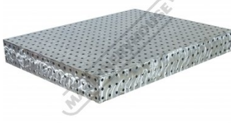
W07840 CertiFlat fabBLOCK 3D Welding Table Top