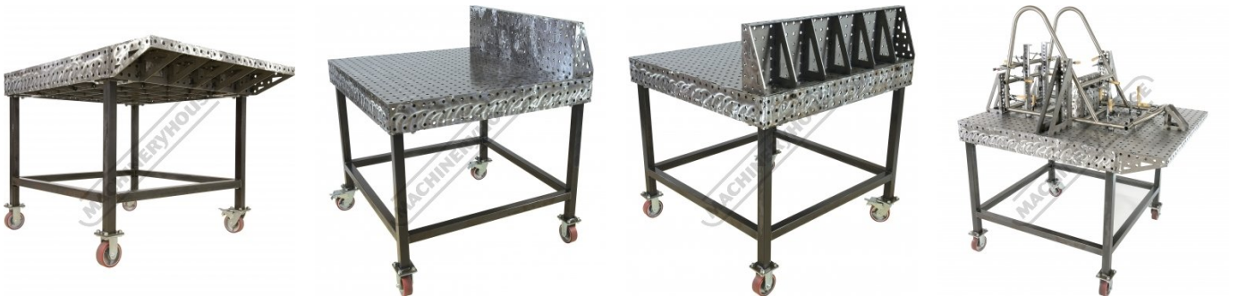
Shown Attached to Optional 3D FabBlock Welding Table 2