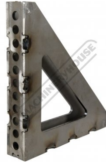
W08164 CertiFlat FabSquare