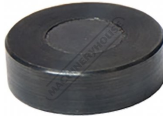
W08030 BuildPro Magnetic Rest Button