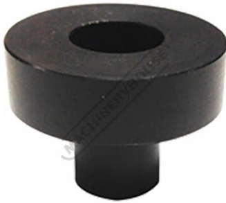
W08012 BuildPro V-Block Spacer