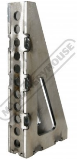
W08162 CertiFlat FabSquare