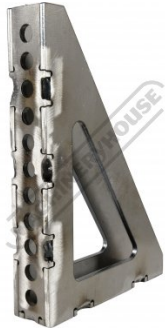
W08163 CertiFlat FabSquare