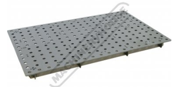
W07801 CertiFlat PRO 1D Welding Table Top