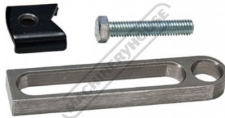
W07895 FixturePoint D-Stop Bar