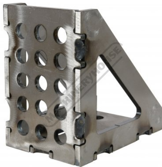
W08170 CertiFlat FabSquare