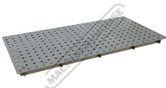
W07802 CertiFlat PRO 1D Welding Table Top