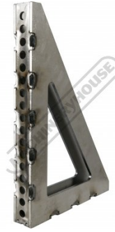
W08165 CertiFlat FabSquare