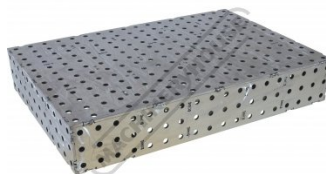
W07832 CertiFlat fabBLOCK 3D Welding Table Top