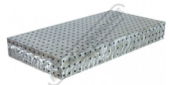
W07834 CertiFlat fabBLOCK 3D Welding Table Top