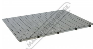
W07803 CertiFlat PRO 1D Welding Table Top