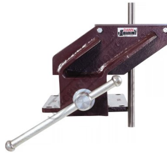
Vertical Work Without Obstruction