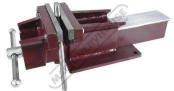
Side View Vertical Work Without Obstruction