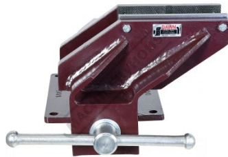
Offset Vice Jaws