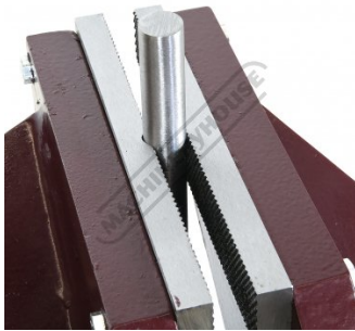
Pipe Vice Jaws