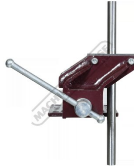
Vertical Work Without Obstruction