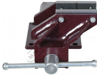
Offset Vice Jaws