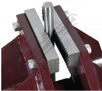
Pipe Vice Jaws