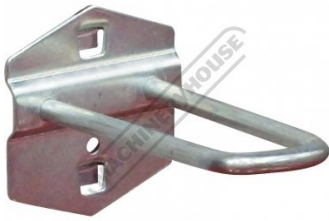
A449 Hook - U Shape Holder