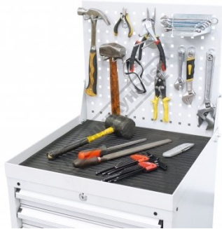
Shown with Optional Tools