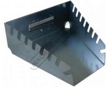
A446 Holder - Spanner