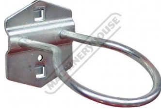
A4496 Round Tool Holder - Loop