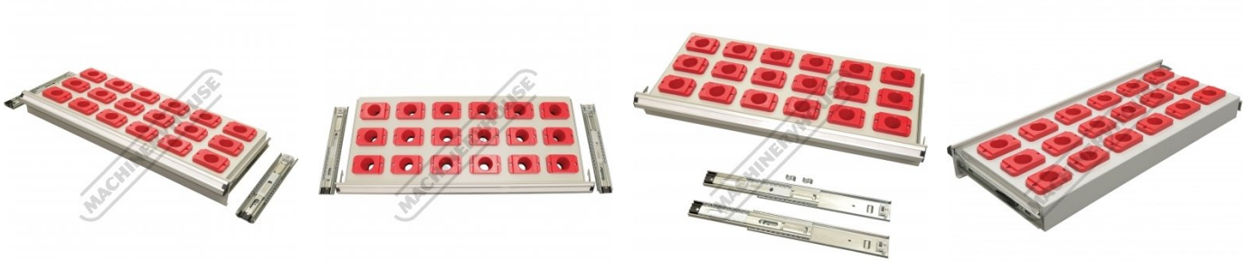
Right Top View