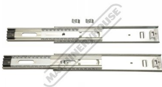
Ball Bearing Slides