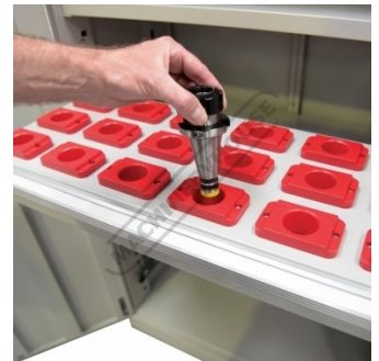
Shown Inserting NT30 Tooling