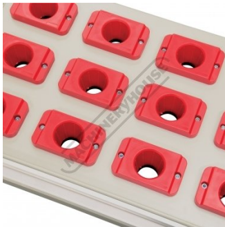
NT30 BT30 Tool Holder