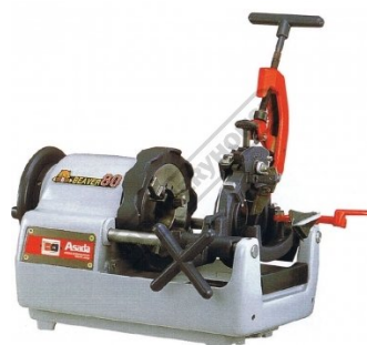
T024A Pipe Threading Machine - Automatic Die Head