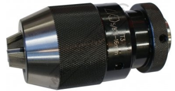
C294 Drill Chuck - Keyless Type