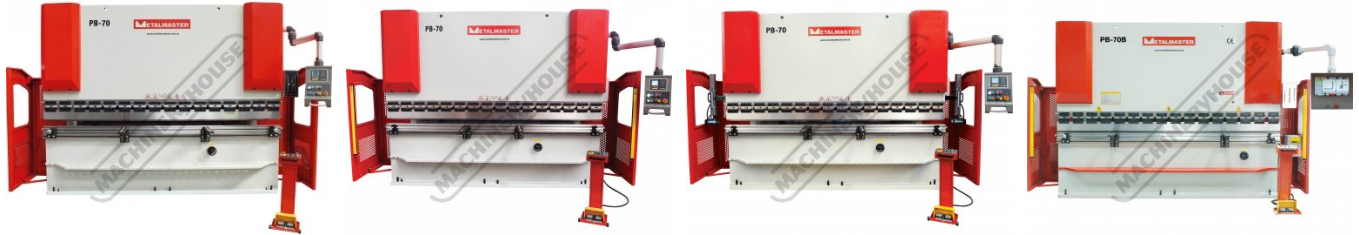
S902F Hydraulic CNC Pressbrake