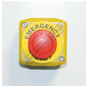
Emergency Stop Switch