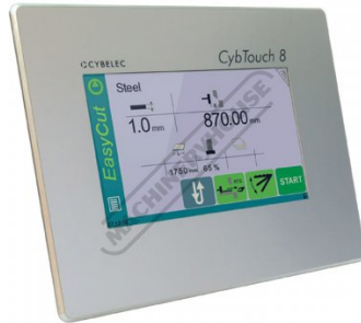
CybeleC Cybtouch 8W Control Unit