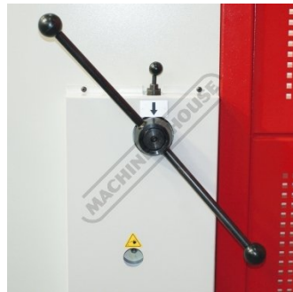
Blade Gap Adjustment Lever