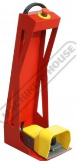
Roving Foot Control