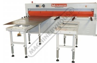
Shown with Optional Ball Transfer Tables - Order Code (L840)