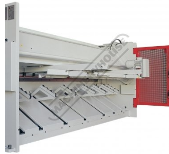
Pneumatic Sheet Supports Type A