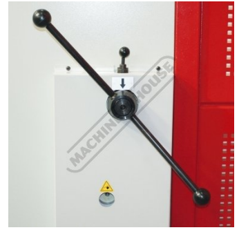
Blade Gap Adjustment Lever