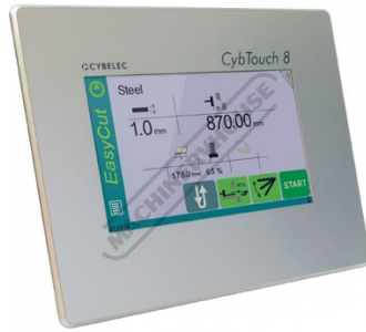
CybeleC Cybtouch 8W Control Unit