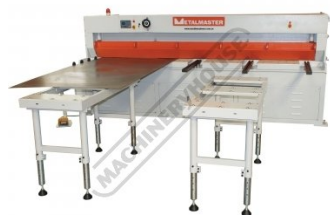
Shown with Optional Ball Transfer Tables - Order Code (L840)