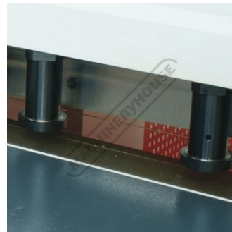
Material Shadow Line