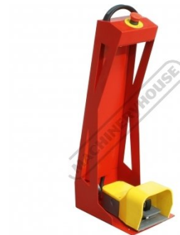
Roving Foot Control