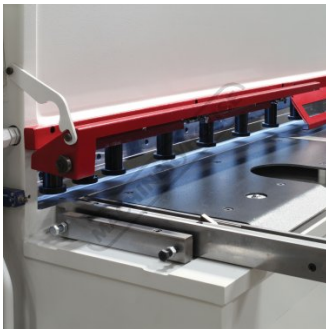
Squaring Arm with Adjustable Stop