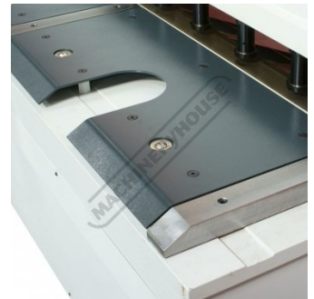
Ball Transfer Table