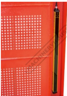
Rear Light Guarding