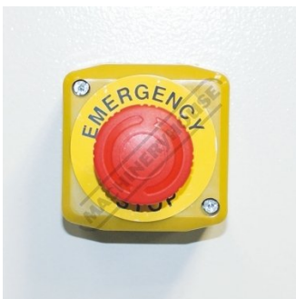
Emergency Stop Switch