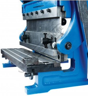
Pressbrake-Guillotine Setup Low View

sales@machineryhouse.com.au www.machineryhouse.com.au