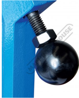
Rear Curving Roll Adjustment Handle