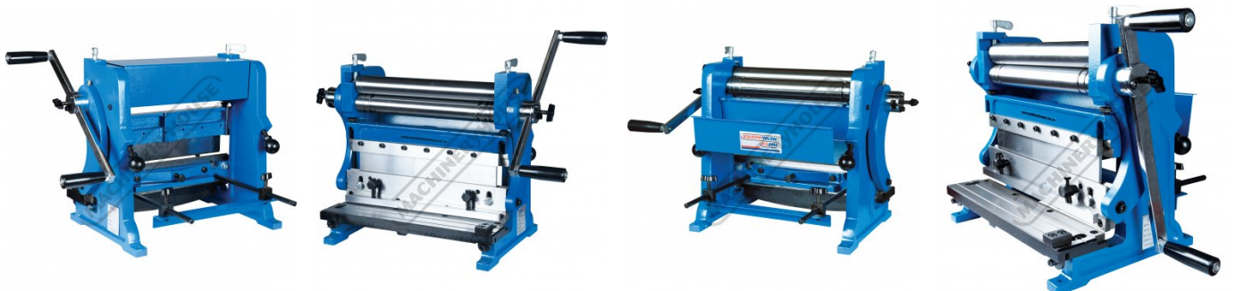
Rear Left View