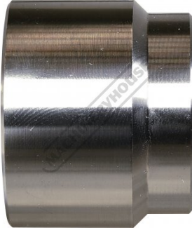
Lower Forming Die Side View (J)