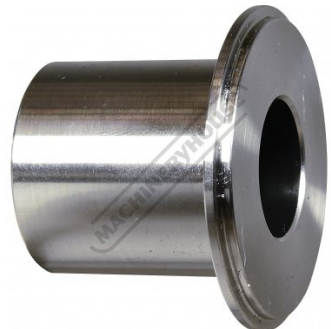
Outside Offset Die (D)