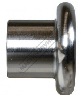
3/8 Inch Tipping Die Side View (G)