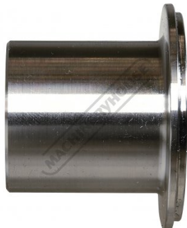
Outside Offset Die Side View (D)