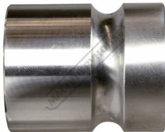
180 Degree Lower Die Side View (B)