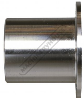
Knife Edge Tipping Die Side View (E)