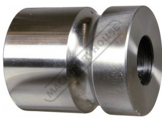
180 Degree Lower Die (B)