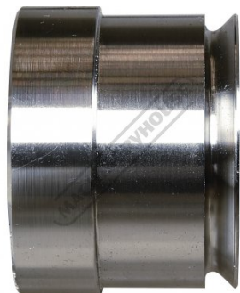
Lower Edge Forming Die Side View (F)