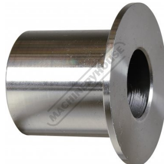
Knife Edge Tipping Die (E)