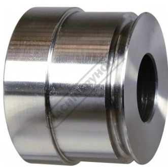
Lower Edge Forming Die (F)