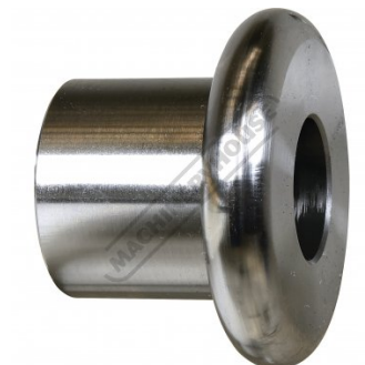
3/8 Inch Tipping Die (G)